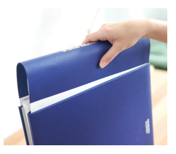
Step 3 Gently lower the spine down so the two rounded corners insert into the album.