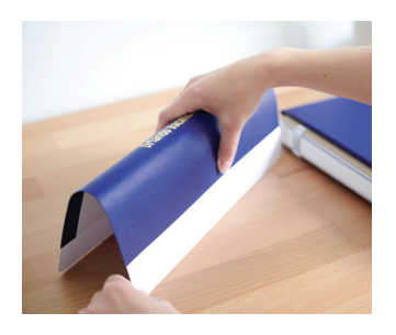
Step 1 Gently curl the spine over using a flat surface to ensure you are bending in the middle.

When you receive your Custom Foiled Spine, you can replace the spine currently in your album with your new Custom Foiled Spine following the steps below: