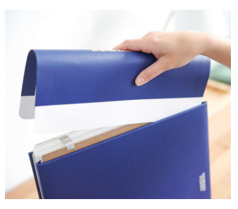
Step 2 Pinch the sides of the spine and insert the two square corners into the album first.