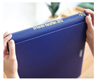
Step 4 Press down gently and evenly on each end of the spine to fully insert the spine into the album.