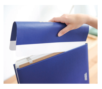
Step 2 Pinch the sides of the spine and insert the two square corners into the album first.