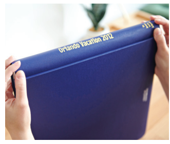
Step 4 Press down gently and evenly on each end of the spine to fully insert the spine into the album.