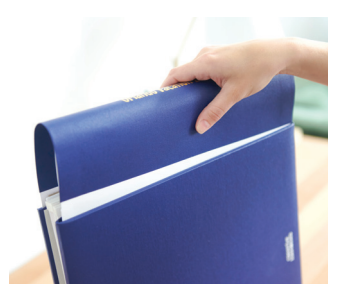
Step 3 Gently lower the spine down so the two rounded corners insert into the album.