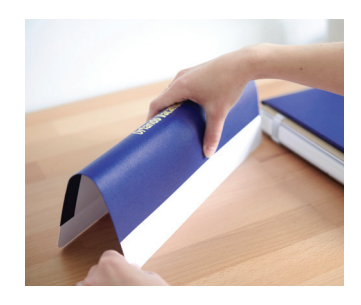
Step 1 Gently curl the spine over using a flat surface to ensure you are bending in the middle.

When you receive your Custom Foiled Spine, you can replace the spine currently in your album with your new Custom Foiled Spine following the steps below: