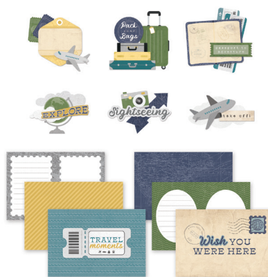
Passport to Adventure Artsy Add-On Kit #662968