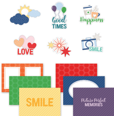
This Life Artsy Add-On Kit #662967