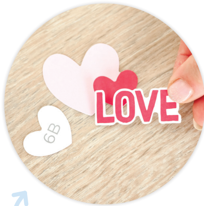
Pieces are labeled A, B, C!

Select three embellishments with the same number on the back (e.g., 1A, 1B and 1C). Adhere the “A” embellishment to the page. Add the “B” and “C” embellishments on top of “A” overlapping each one slightly.