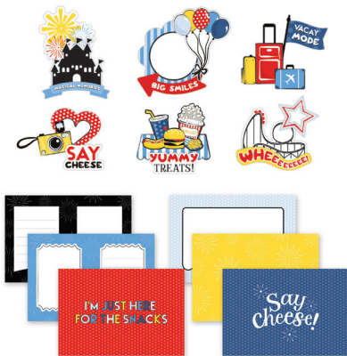
Adventure Parks Artsy Add-On Kit #662971

Learn how to layer and assemble like a pro with Artsy Add-On Kits! Perfect for beginner scrapbookers, each kit includes embellishments to make 6 clusters and includes 12 decorative mats.