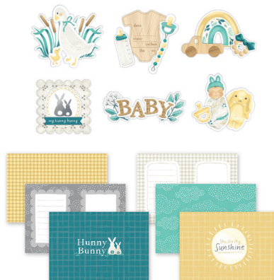
Welcome Baby Artsy Add-On Kit #662969

Artsy Add-On Kits $8.00 USD $9.50 CAD $15.00 AUD