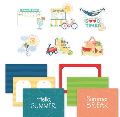
Summer Break Artsy Add-On Kit #662970