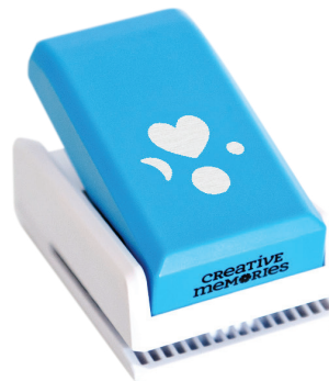
Cutouts: Heart, Crescent moon, Large circle, Small circle