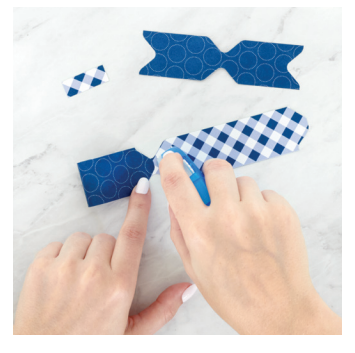
Step 6 To assemble the bow, gently fold over the left and right sides of paper A to meet in the middle and adhere.