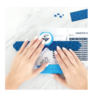
Step 4 Unfold paper A and notch at the center crease. Then turn the paper 180 degrees and notch the other side.