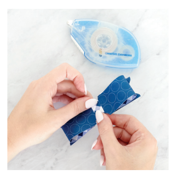
Step 8 Wrap paper C around the center of the bow and adhere. Your bow is complete!