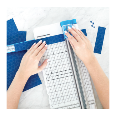
Step 2 Use the 12-inch Trimmer to cut papers A, B and C according to the size chart.