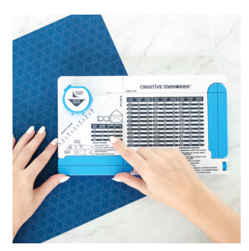
Step 1 Choose the size of bow you want to make. Then use the Bow Size chart to determine how long to cut each of the three papers. (Note that all three will be the same width.)