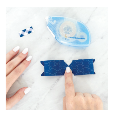
Step 7 Next, adhere the folded paper A on top of paper B.