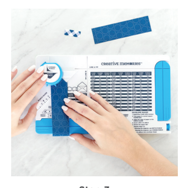
Step 3 Fold paper A gently in half, and on the edge where both papers meet, notch the left and right corners with it still folded. To do this, line up the edge of the paper in the middle of the V-shaped guideline on the Notch Punch.