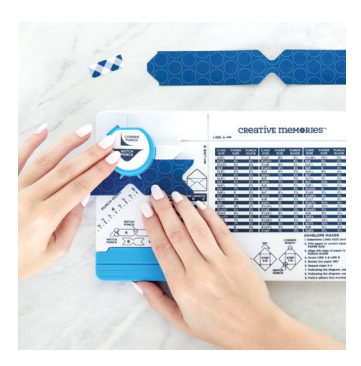
Step 5 Fold paper B gently in half, and on the edge where both papers meet, notch the middle with it still folded. Then unfold paper B and punch the notch in the center on both sides like you did with paper A.